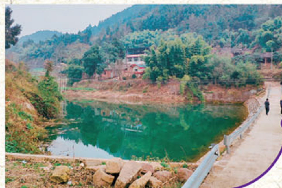
① 施工过程中 Work in progress