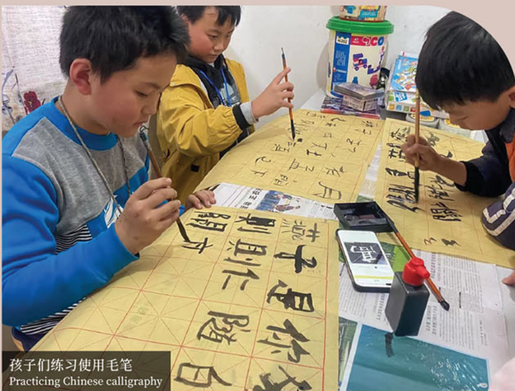
孩子们练习使用毛笔 Practicing Chinese calligraphy