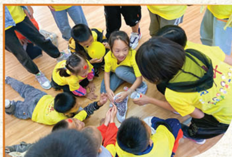
夏令营活动:组员在商量才艺展示 Summer camp activity: Team members discussion for talent show

Living allowance was provided to 30 disadvantaged children in Qingshen County, Sichuan Province to relieve the financial burdens for their families. These children are with physical disabilities, whose parents are being imprisoned, or from families with special needs. Through company of volunteers, the children feel they are loved and cared. The Project also organised prison visits and summer camps to help children reconnect with their parents and help disadvantaged children to better integrate in the community respectively. This helps to change their living conditions and communicate with others and boosts their physical and emotional wellbeing. 30 local volunteers have been trained to match with the children one-on-one, paying monthly visits to keep them company.