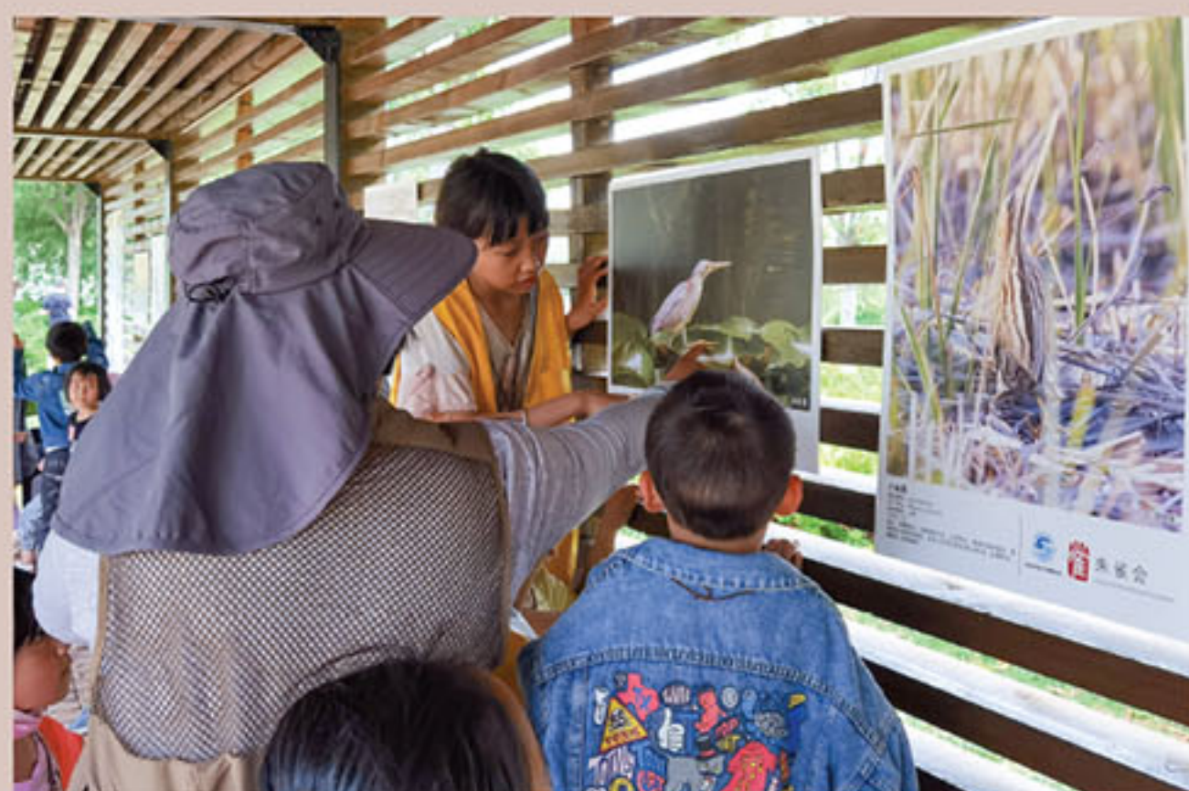
▲ 周末户外活动 Outdoor activity at weekends