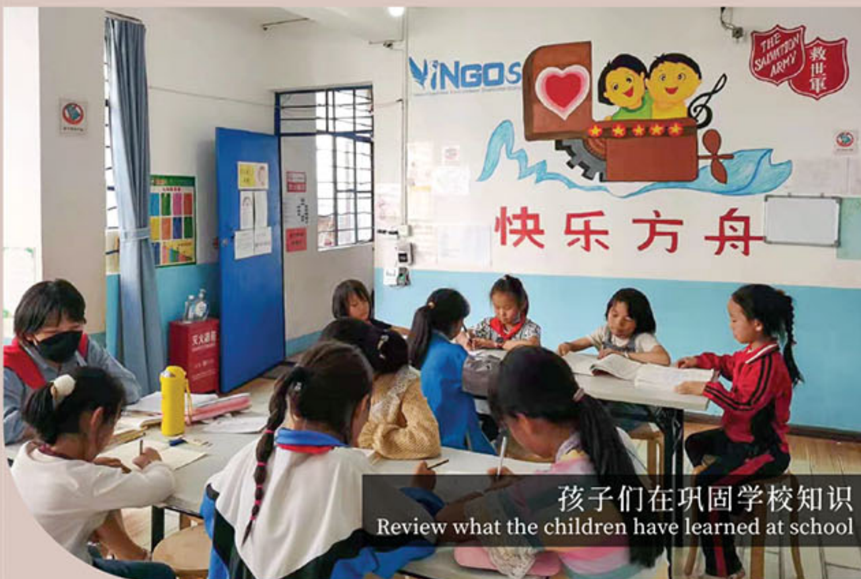
孩子们在巩固学校知识 Review what the children have learned at school