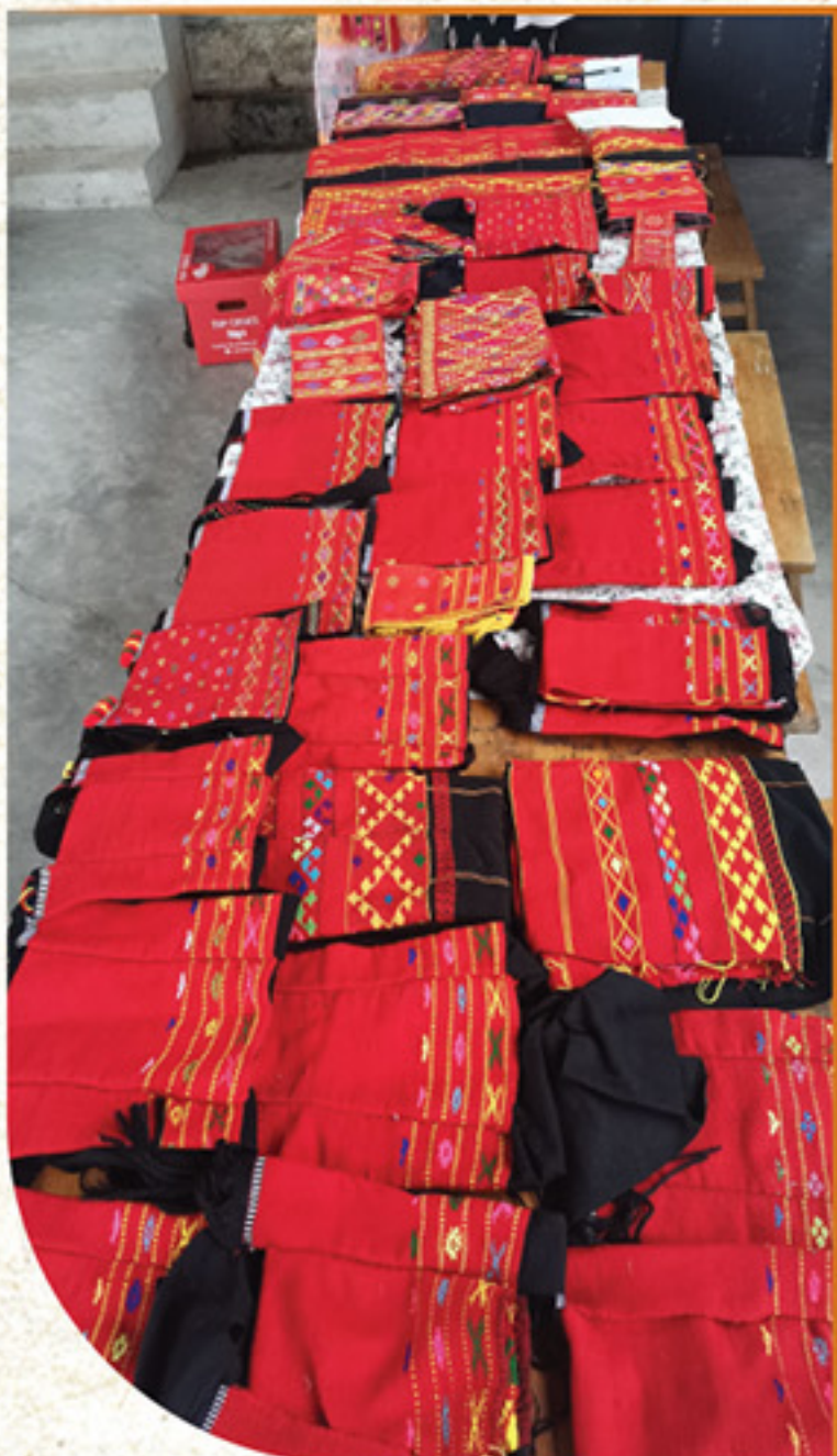
景颇族织锦项目二期 Jingpo Brocade Weaving Project Phase Two

Phase Two of the Project continued to provide traditional brocade weaving skills training to the Jingpo women in Babian Village, Longchuan County, Yunnan Province, helping to increase their income and improve financial condition of their families, at the same time passing on the Jingpo brocade tradition. 90 female villagers benefitted from the Project. Currently, Jingpo brocade weaving has become a highlight of Babian Village, which is also a reason why the Village has gained more funding and policy support from the local government. Owing to the pandemic, some events of the Project were postponed to 2022.