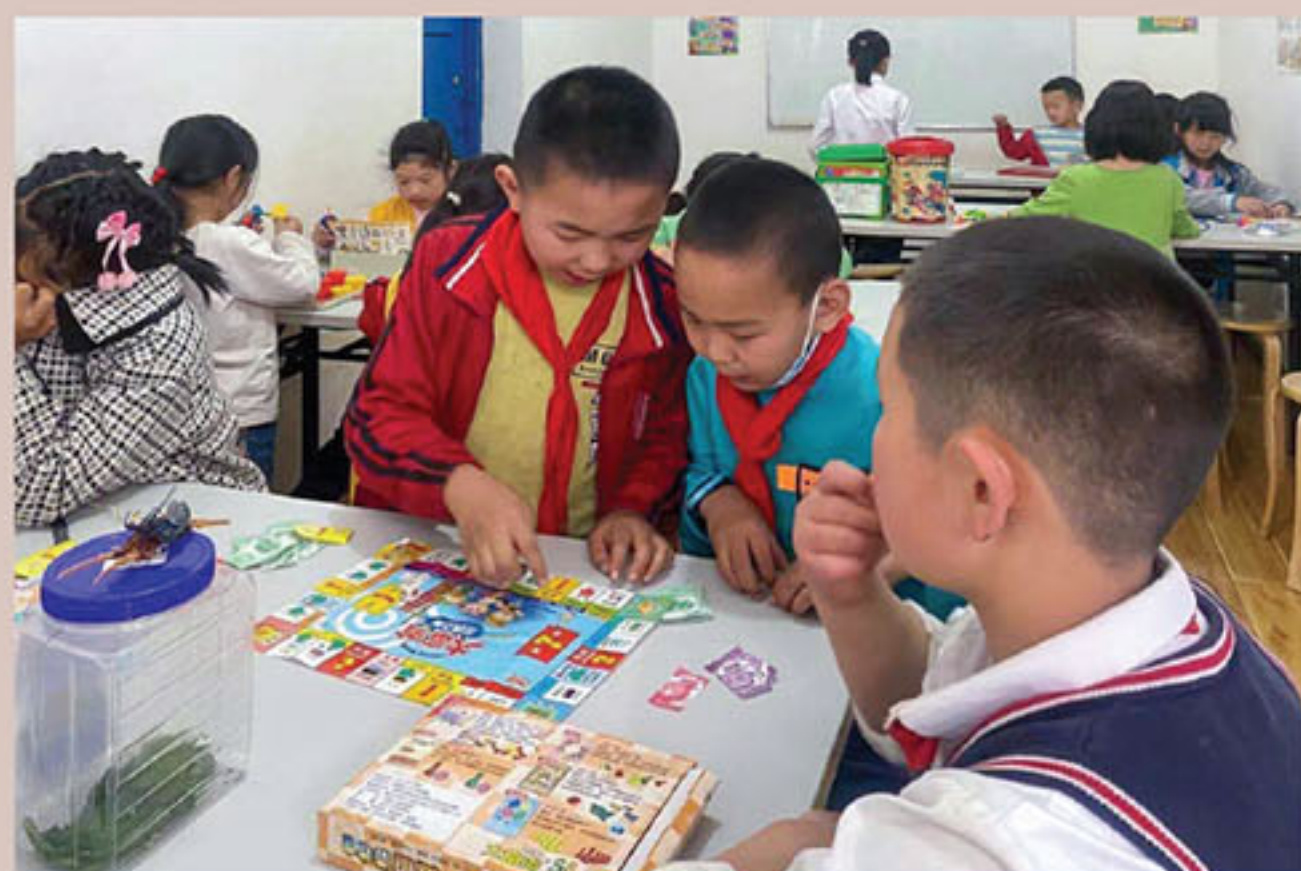
▲ 孩子们在玩游戏 Children playing all kinds of games

在小珍眼中，快乐方舟已经成为她在社区的另外一个「家」。她每天放学都会到方舟去完成作业，与老师和同学一起游戏、阅读，周末她也会积极参加快乐方舟的活动，学习有益的课外知识和培养正向的兴趣爱好，现在她是方舟的一名小小志愿者，向新来朋友介绍方舟，帮助他们融入方舟的生活。