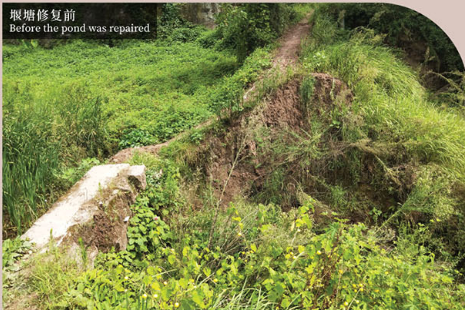
堰塘修复前 Before the pond was repaired